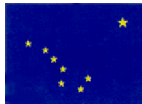
"North to the future"